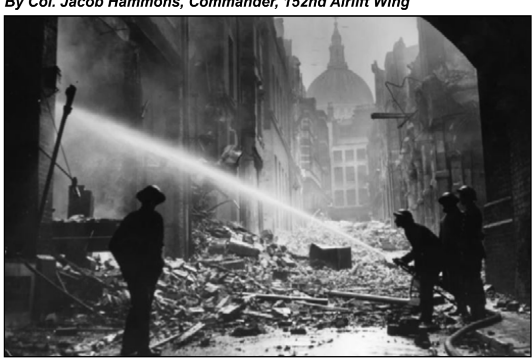
Second World War. It is 2020 people! For many of us, the dawning of a new decade signals

By Col. Jacob Hammons, Commander, 152nd Airlift Wing